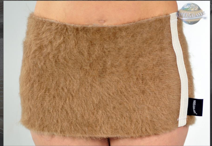
Elastic warming belt with camel wool