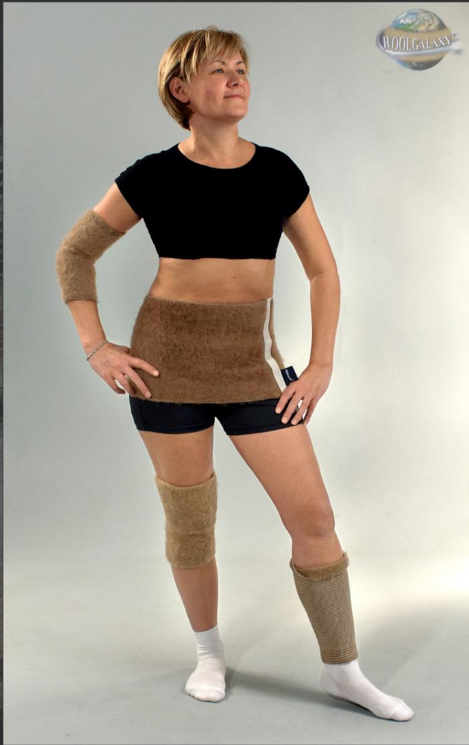
Elastic warming knee-guard with camel wool